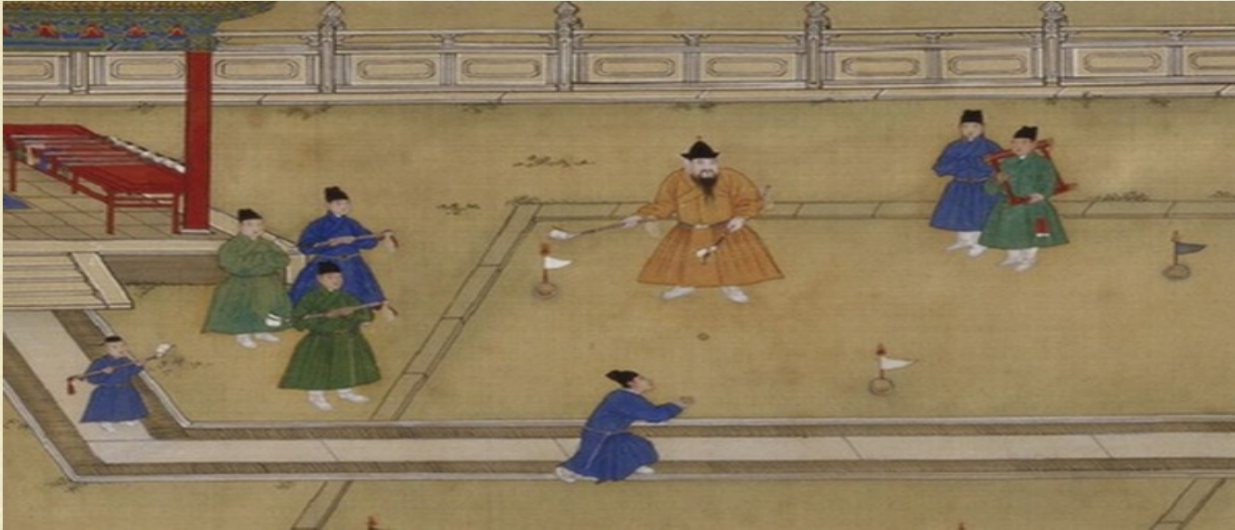
Chuiwan, played during the Song dynasty (960–1279 AD)