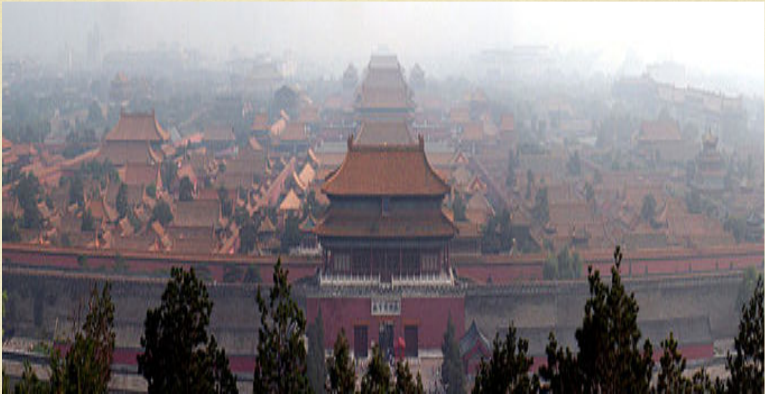
Above: The Forbidden City, Built in Beijing from 1406 to 1420