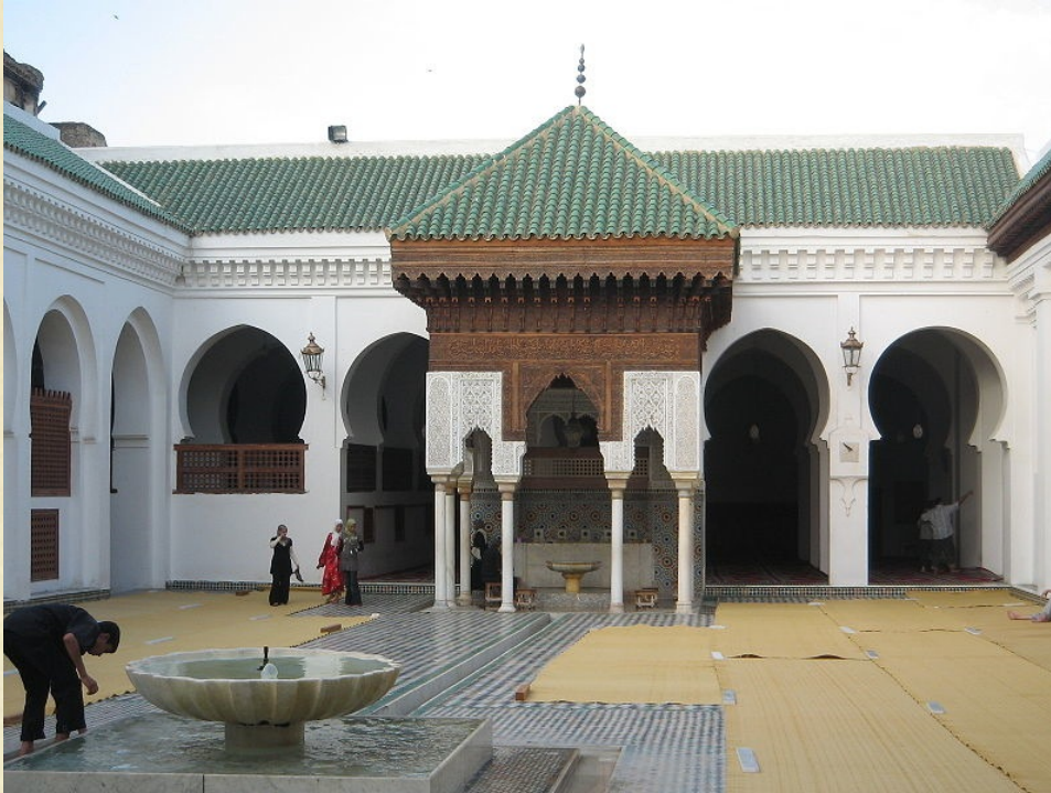
The University of Al-Karaouine in Fez, Morocco, founded in 859 AD